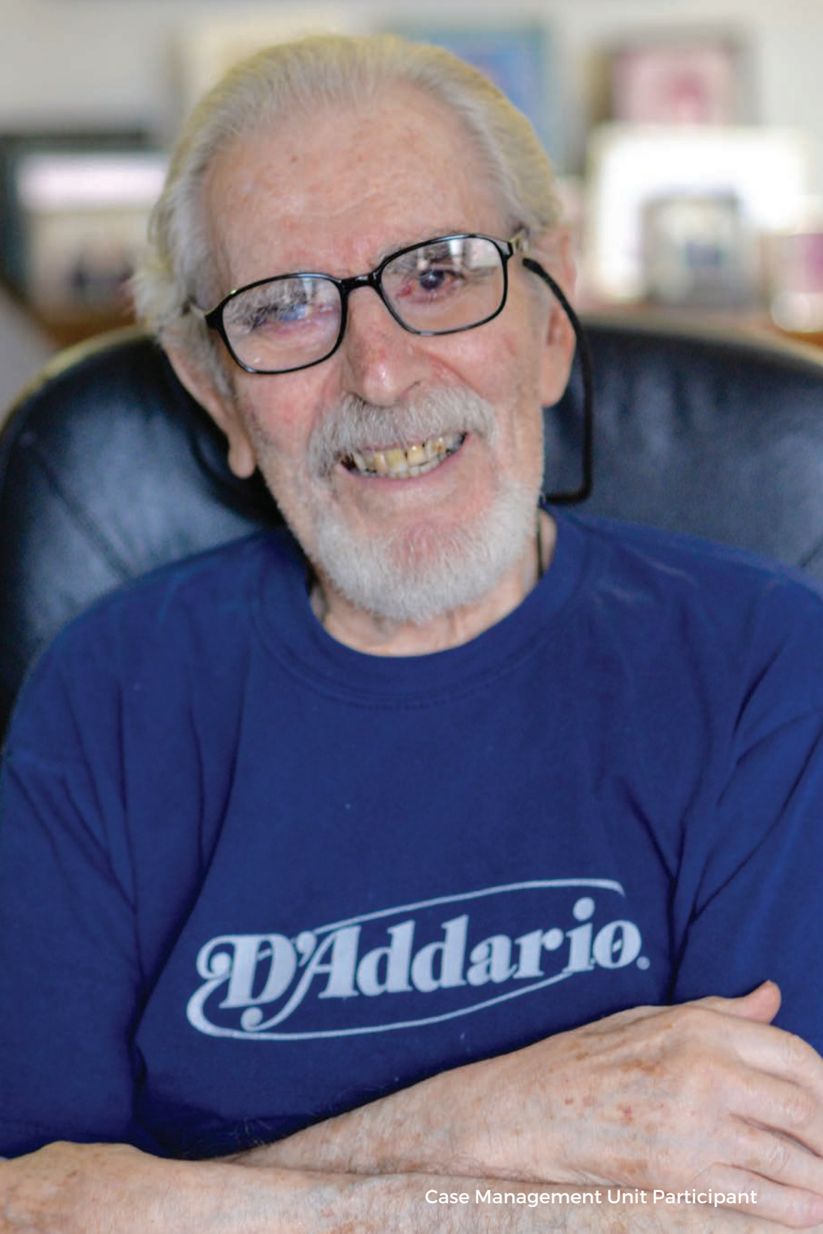
Case Management Unit Participant