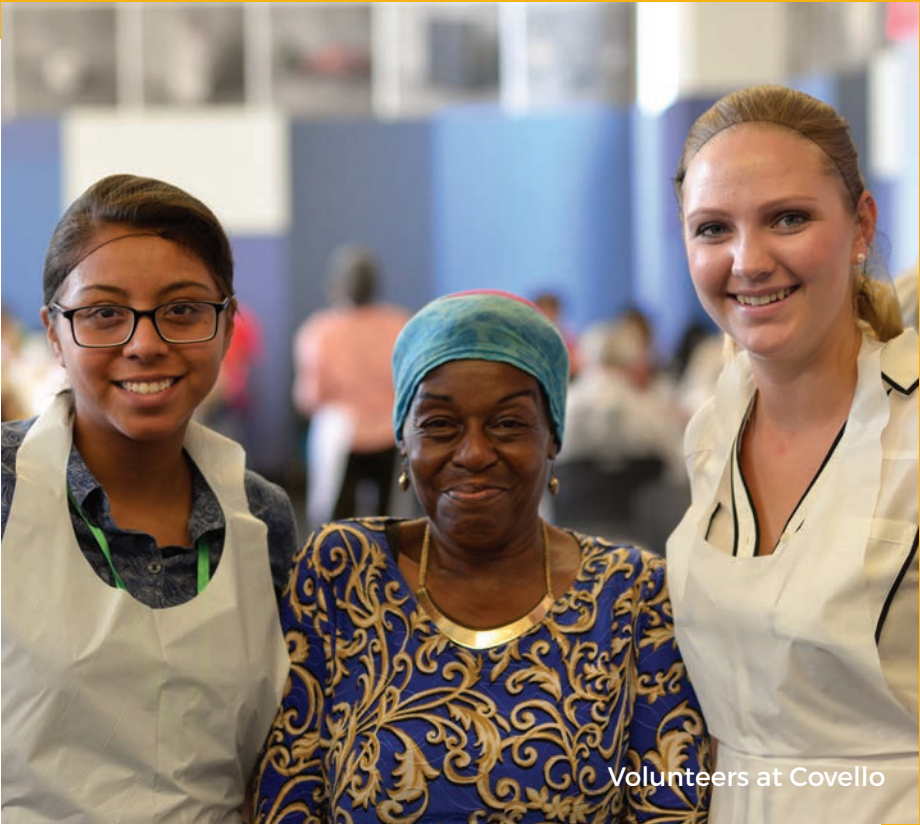
Volunteers at Covello

We encourage individuality, celebrate culture and ensure your voice is heard. We not only want you to feel involved, but inspired. We strive to help you begin the discovery of your best self the moment you walk through the doors of one of our centers or programs or receive a visit from our staff in your own home.